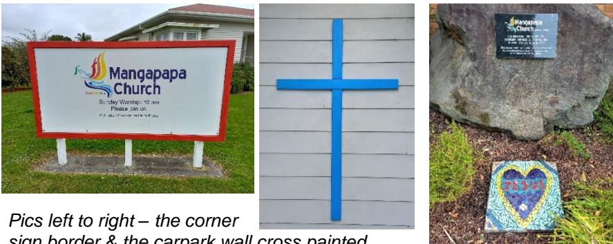
Pics left to right – the corner sign border & the carpark wall cross painted. A 'Jesus mosaic' uncovered in the garden! Thank you everyone who came along to garden, paint, water-blast, clean windows, clean auditorium chairs, clear spoutings, door repairs etc.

WANTED House to Rent: For about a month over Christmas, from 16 th December to 4 th January . For a young couple with a 2 year old. Please contact Lyn Hawksworth if you know of anything.