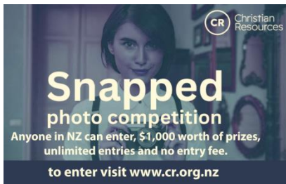
Photo Competition - Christian Resources is organizing "Snapped," a national photography competition to promote the launch of their new stock media website, CR Media. Running until 31 st August , photographers of all skill levels can participate in "Snapped" for a chance to win fantastic prizes. It's free to enter, and multiple submissions are welcome.