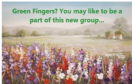
Green Fingers? You may like to be a part of this new group...

–Our first gathering of this new group is set for 1:30pm Tuesday 19 July in the Church House. It is for people who love gardens, gardening, growing and seeing God's hand, His joy and His lessons for us in it all. It is not 'to do' gardening, but to share. So, you are invited to muster on the 19 th , to first of all meet and talk about where we go with this. Bring along a piece from your garden that someone else would / could love.