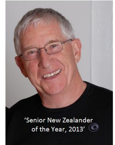
'Senior New Zealander of the Year, 2013'

Sponsored by Mangapapa Church, Gisborne, as part of our '100 years' Celebration