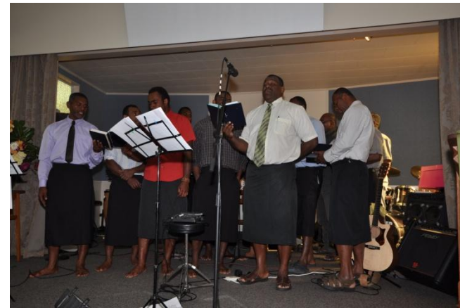
3 The Fijian Worship Group in full voice & harmony