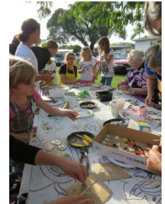
4 The Centenary Mosaic work progresses well