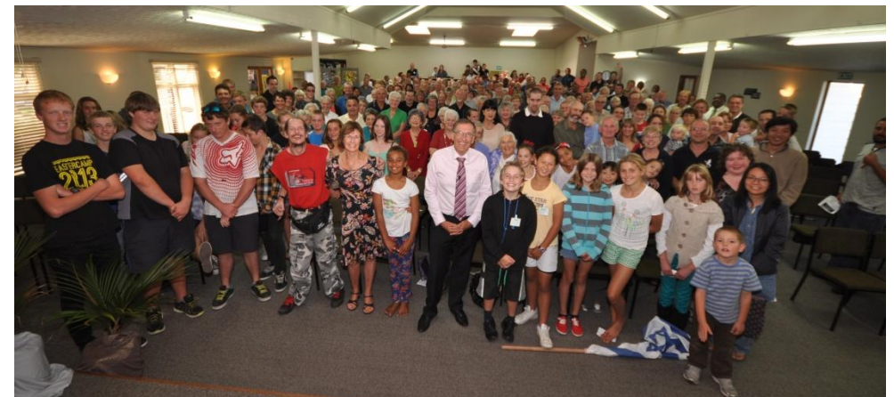
5. Were you there? The Anniversary Service 10am, 14 April